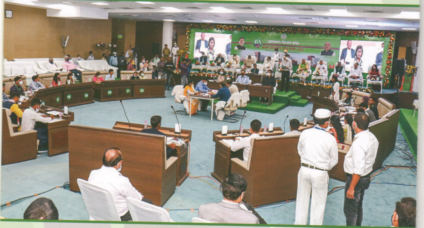
The 24 students were divided in Treasury and Opposition benches sat in actual Assembly like set up